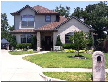
April Yard of the Month 618 Hosanna Ct.