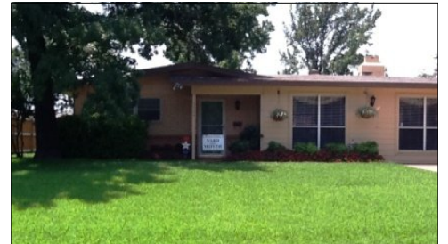
June Yard of the Month 2924 Pritchett

Look for all your neighborhood information online