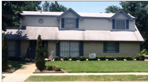
May Yard of the Month 621 Beacon Hill Dr.