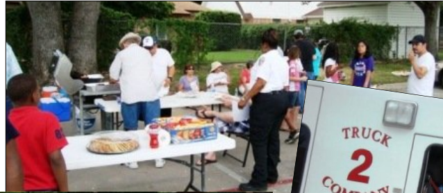
June Neighborhood Meeting & Barbeque