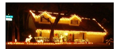
December Yard of the Month Runner-up, Lexington

Look for all your neighborhood information online by April at www.bartonestates.com