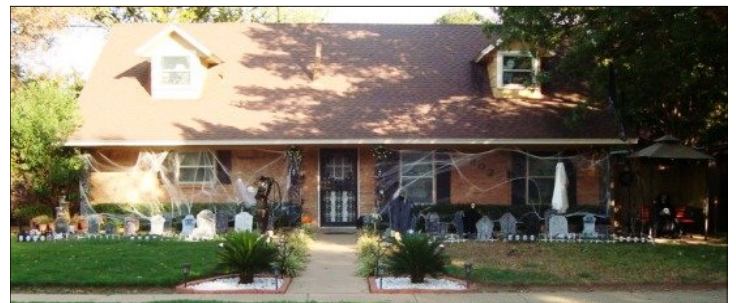
October Yard of the Month, 802 Beacon Hill