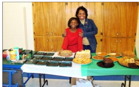
Christmas Dinner, December 2010