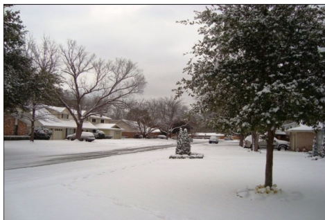
Snow Storm Winter 2011