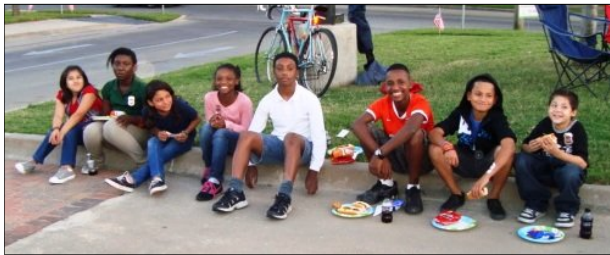
National Night Out October 5, 2010