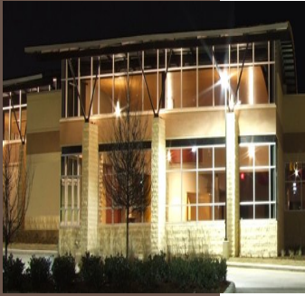
West Irving Library, 4444 W. Rochelle Road

Final touches are being added to the West Irving Library, 4444 W. Rochelle Road, in anticipation of its grand opening from 10 a.m. to noon April 9.