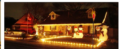
December Yard of the Month, 802 Beacon Hill