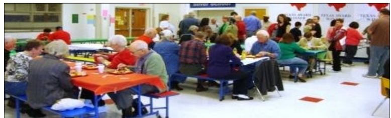
Christmas Dinner, December 2010