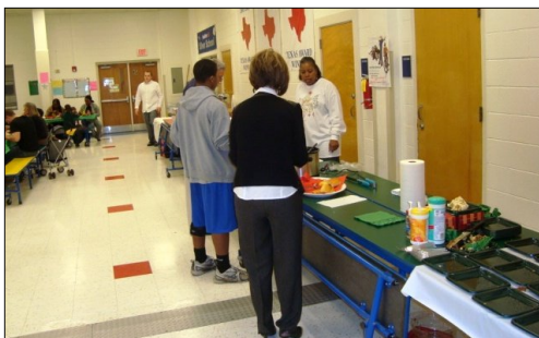
Christmas Dinner, December 2010