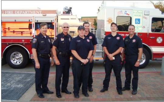
National Night Out October 5, 2010